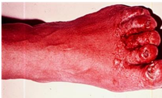
Fig. 3: Lesions of Tinea pedis