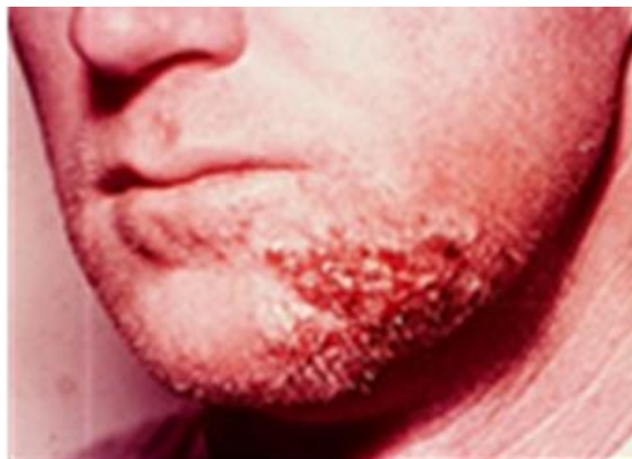
Fig. 2: Lesions of Tinea barbae