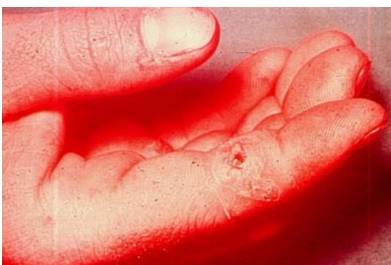
Fig. 4: Primary lesion of sporotrichosis